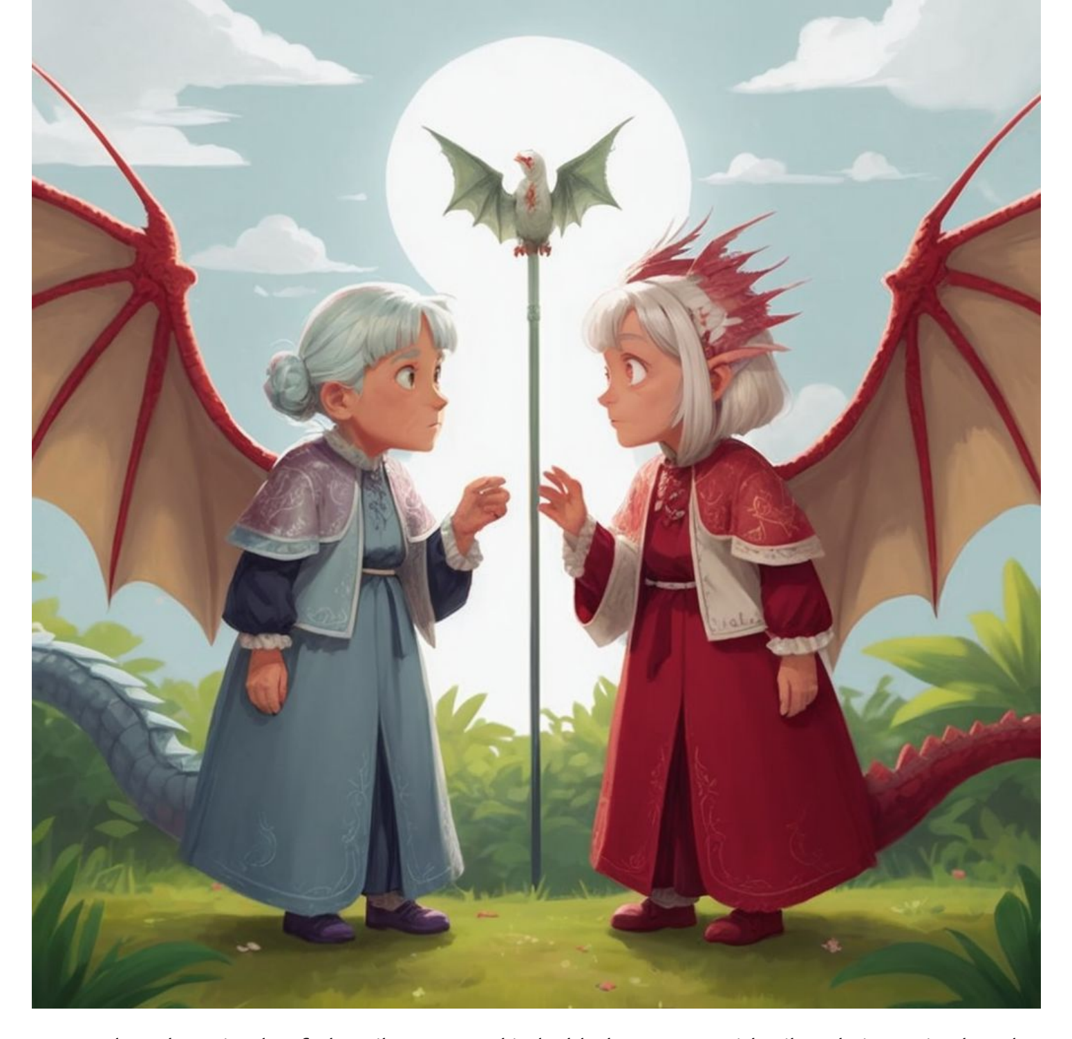
One day, the Friends of the Library, two kind elderly women with silver hair, noticed Red Dragon's sadness. They promised to help find Orange Dragon and bring the friends together.