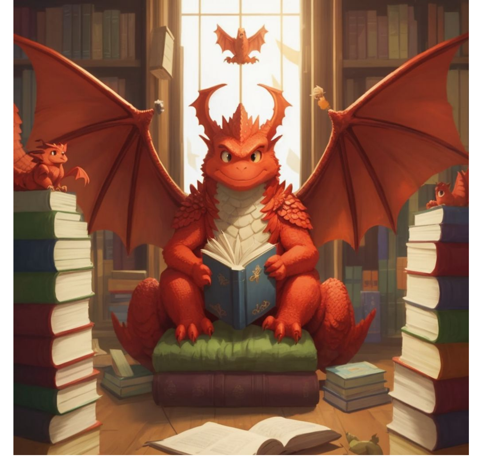
Once upon a time, in a cozy library, there lived a friendly and happy dragon named Red Dragon. Red Dragon loved spending time with the children who came to read books.