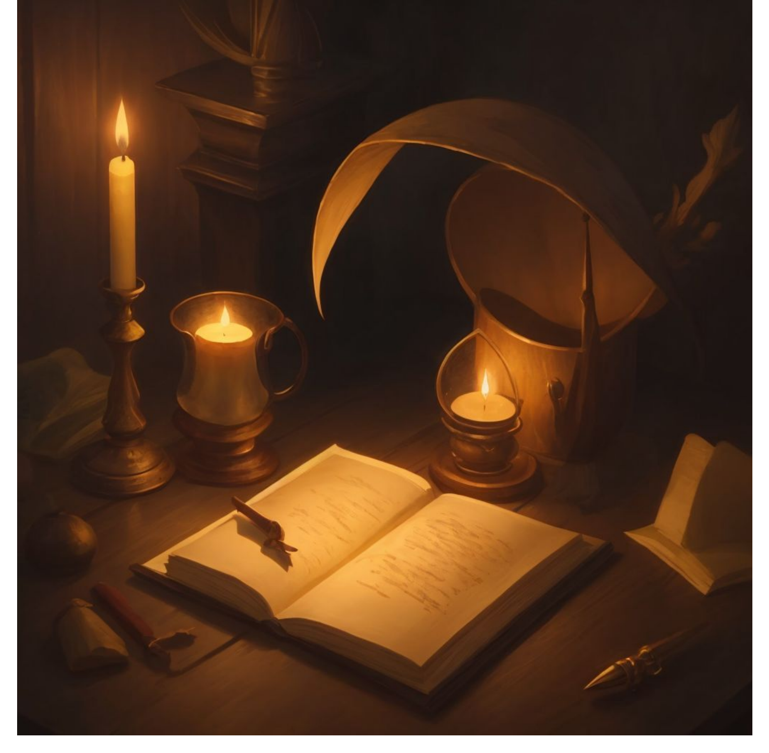
After days of research, the Friends of the Library finally found Orange Dragon's home. They quickly wrote a letter inviting Orange Dragon to visit Red Dragon at the library.